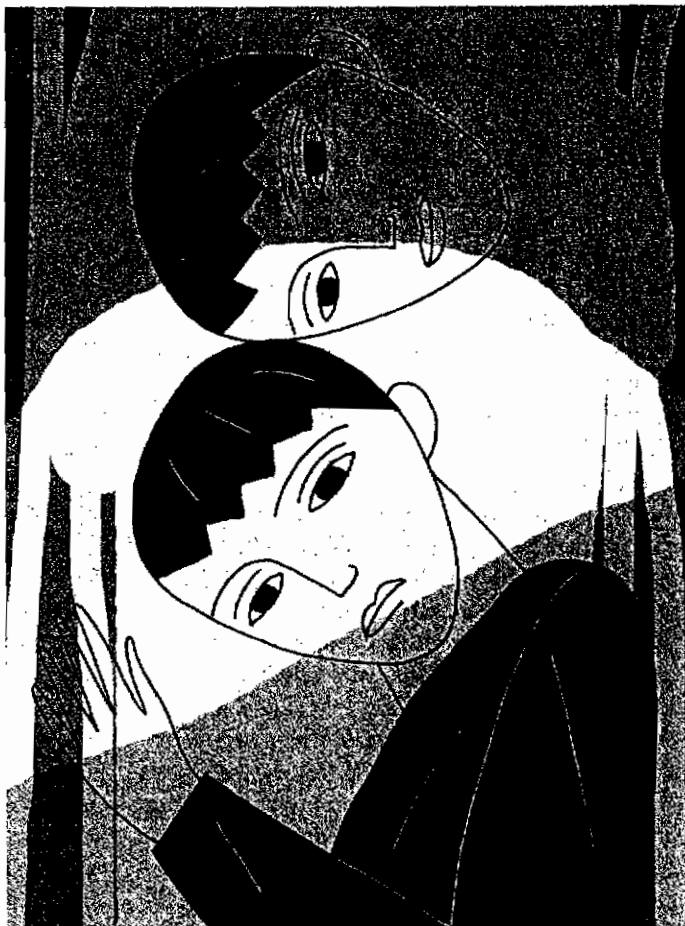
Is it possible to make a bipolar diagnosis before adolescence?

In August, 2001, the results of the meeting were published in the Journal of the American Academy of Child and Adoles-