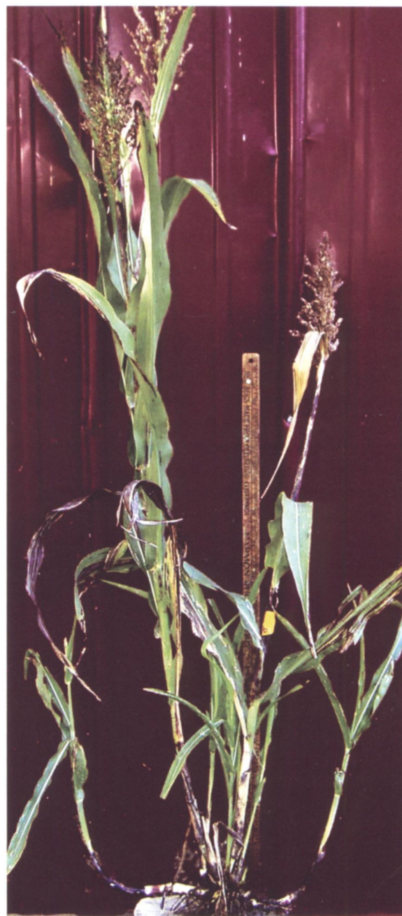
Figure 3. A relatively short sorghum plant with a relatively compact panicle (seed head) showing emergence of shoots from underground rhizomes in October 2005. This plant was excavated from a field experiment designed to evaluate families derived by self-pollination from hybrids between male-sterile grain sorghum and perennial sorghum. A meter stick is shown in the photograph. Fall emergence of rhizome shoots is not a desirable trait in itself, because such shoots will die with the first freeze. The ability to produce rhizomes is necessary for sorghum perenniality, however, and plants in which fall rhizome emergence is observed are more likely also to produce winter-hardy rhizomes that emerge the following spring. More than 300 plants in the population to which this plant belongs did emerge in spring 2006.

Even with expanded efforts, the road leading to perennial grains will be long, and it may often be rough; however, the time required should be put in context. Had large programs to breed perennial grains been initiated alongside the Green Revolution programs a half-century ago, farmers might well have had seed of perennial varieties in their hands today. As